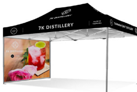
3m FULL WALL

Standard colours, single side or double side custom print. Hardware: 4.5m kedar wall bar.