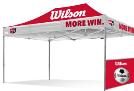
3m HALF WALL

Standard colours, single side or double side custom print. Hardware: 4.5m top & bottom kedar wall bars.