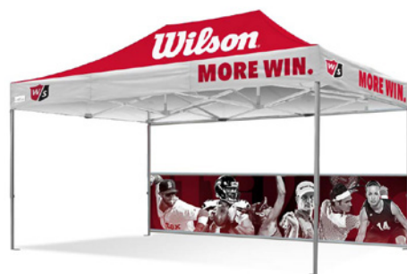
4.5m HALF WALL

Half walls use kedar wall bars to secure the top and bottom and track into the marquee legs on the sides.