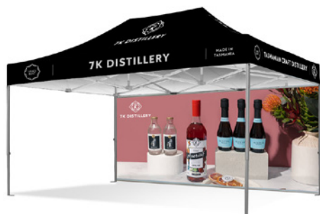
4.5m Q8 FULL WALL

Hooks along the top edge of wall attaches to the roof, a kedar wall bar secures the bottom and the wall tracks into the marquee legs on the side.