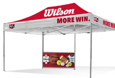
2.6m HALF WALL

Standard colours, single side or double side custom print. Hardware: 3m top & bottom kedar wall