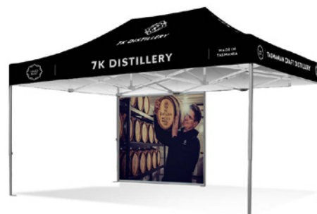
2.6m FULL WALL

Standard colours, single side or double side custom print. Hardware: 3m kedar wall bar.