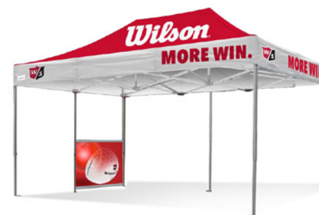
1.5m HALF WALL

Standard colours, single side or double side custom print. Hardware: 2.6m top & bottom kedar wall bars plus a Q8 instert leg.