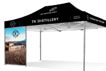
1.5m FULL WALL

Standard colours, single side or double side custom print. Hardware: 2.6m kedar wall bar plus a Q8 instert leg.