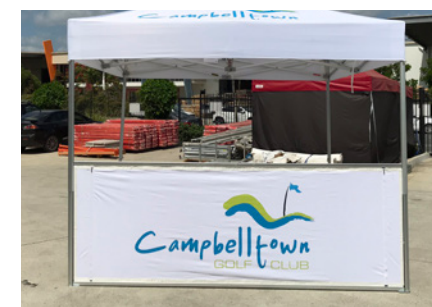
Custom marquee with custom 3m half wall.