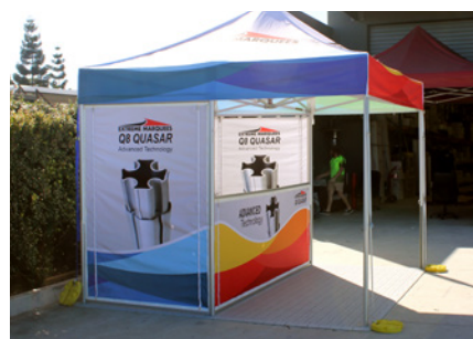
1.2m full perimeter walls (2) and 3m internal partition half wall.