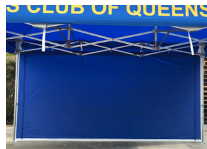
Custom marquee with a standard blue full wall.