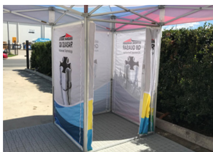
1.2m full perimeter walls (2) and 1.2m internal partition walls (2).