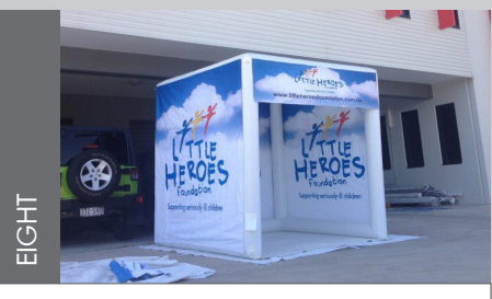
Continue to to attach velco walls.