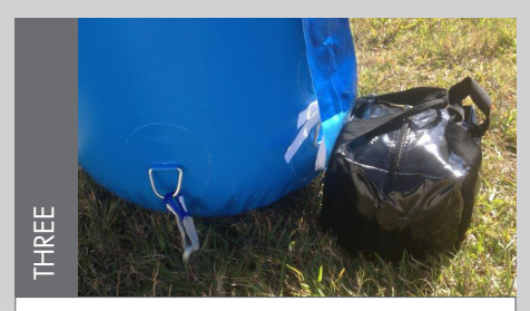
Remove all sandbags and pins and store.