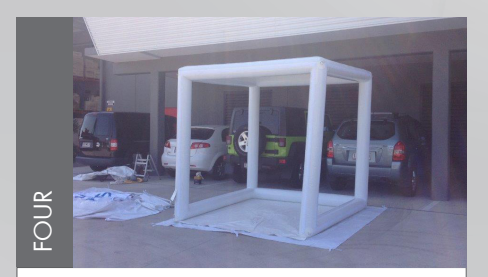
Ensure all legs are lined up. Check frame is firm (do not overinflate).