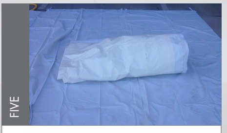
Proceed to roll marquee up. Pack marquee into protective cover.