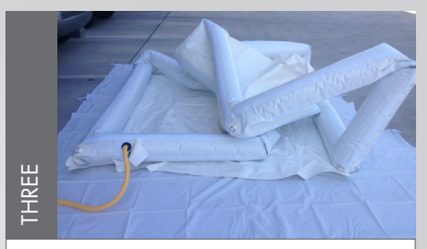
Turn pump on and proceed to inflate.