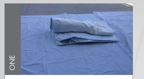
Layout ground sheet out and roll out the marquee.

Recommended procedure below. For safety reasons it is recommended that 2 persons set up any marquee. Ensure area is free from any sharp objects & overhead objects.