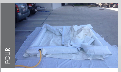
Deflate and allow cube to fold down.