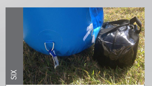
As soon as pressure is correct proceed to attach sandbags or pins to legs.