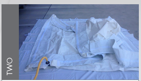
Connect pump to inlet valve using the (OUT) end of pump.