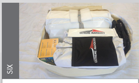
Roll up ground sheet and store inflatable and all accessories into bag.