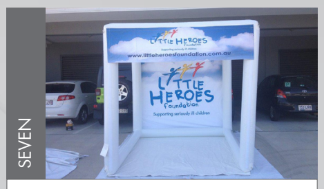
Attached the velcro walls.