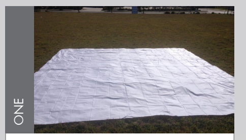
Lay ground sheet out into position to protect inflatable.

Recommended procedure below. For safety reasons it is recommended that 2 persons set up any marquee. Ensure area is free from any sharp objects & overhead objects.