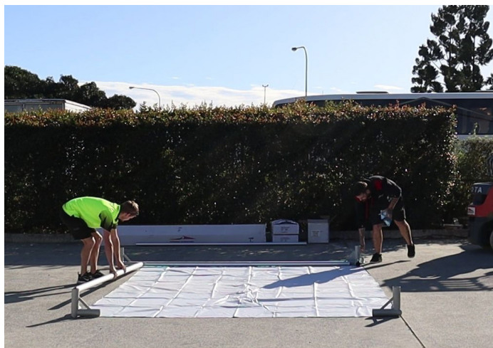
Layout all roof beams and connectors into position.

Please read instructions completely before setting up your marquee. Make sure you have all the components identified on the Parts List. Recommended procedure below. For safety reasons it is recommended that 2 persons set-up / pack down any marquee.