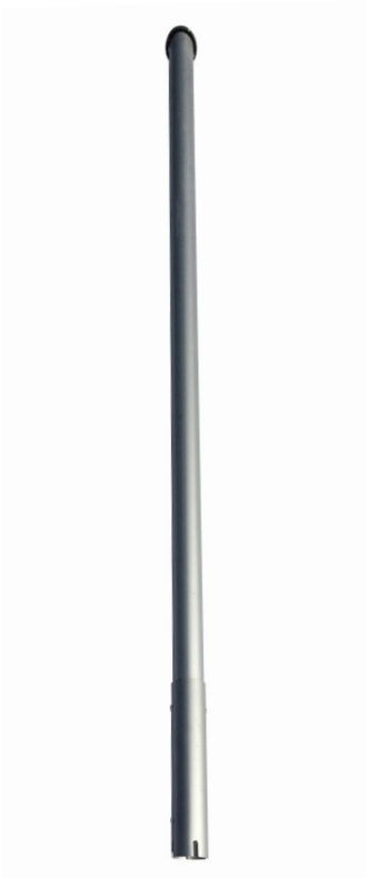
Aluminium Center Pole (x1)