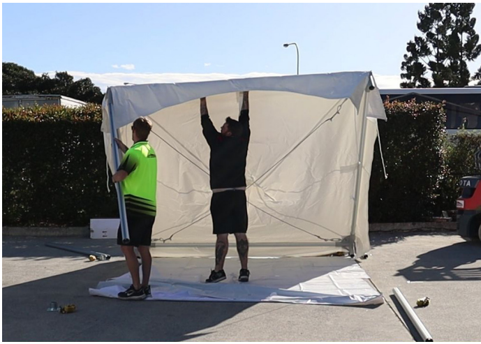
Insert two of the legs into the corner connectors.