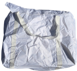
PVC Roof / Protective Cover (x1)