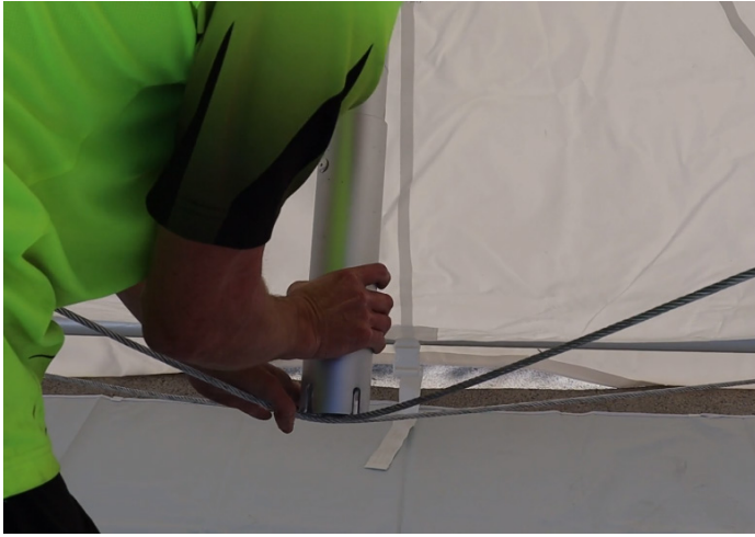
Remove center pole.