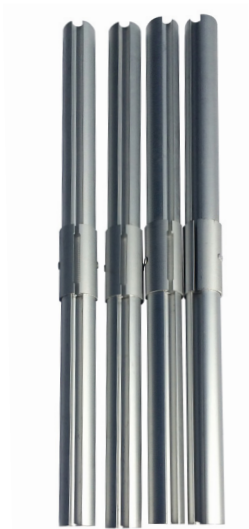
Aluminium Roof Joiner (x4)