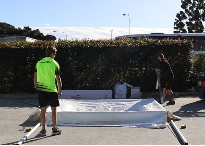
Remove remaining two legs and fold up roof. Ensure roof is completely dry before packing away. Remove cross wires and disassemble the frame and store in protective cover.