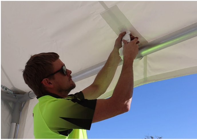
Attach roof straps around roof beams. Repeat on all sides.