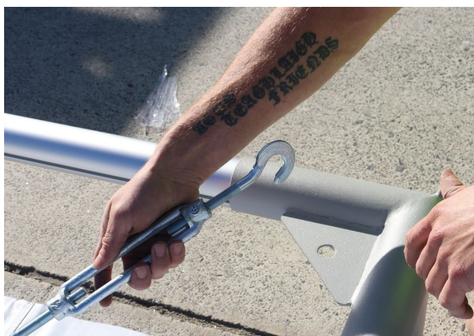
Attach both cross wires from corner to corner.