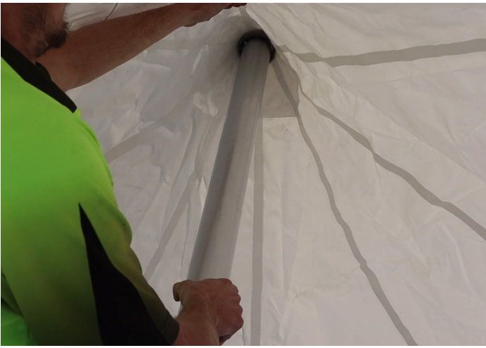
Position center pole in the peak of the roof