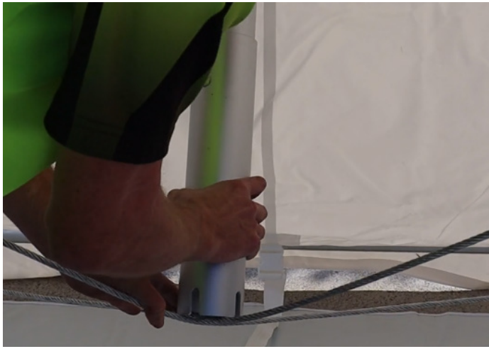
Slide the centre pole into cross wires and position.