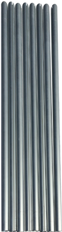
Aluminium Roof Beams (x8)