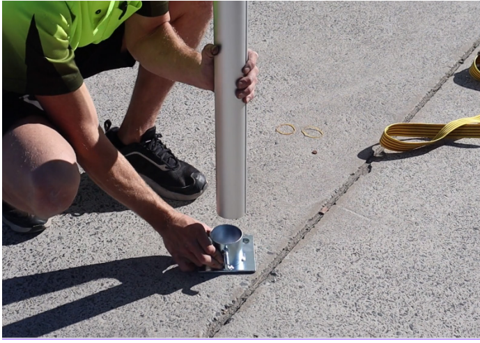
Attach steel foot to the bottom of Legs. Repeat on all sides.