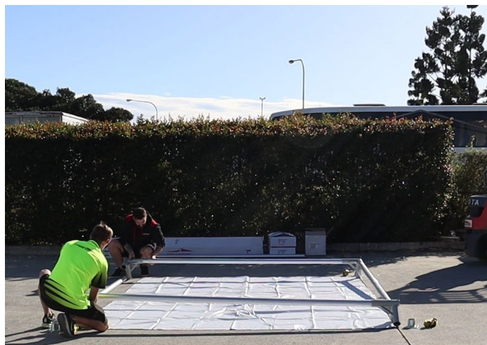
Once in place connect the 4 steel corner connectors to the 4 aluminium roof beams.