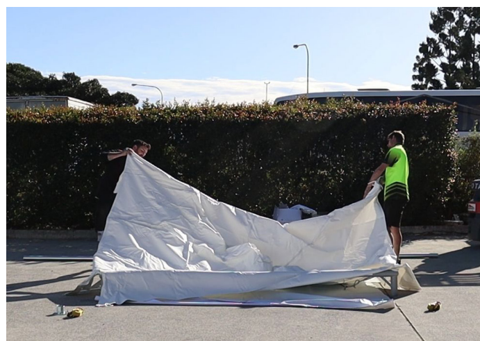
ATTACHING THE PVC ROOF Layout PVC roof over the frame.