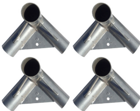
Steel Corner Connector (x4)