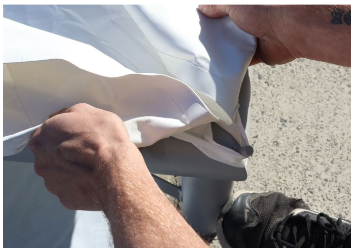
Attach all corners of the PVC roof to the corner connectors on the frame.