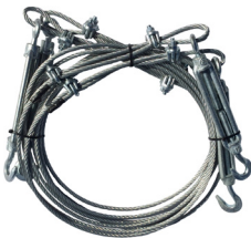
Steel Cross Wires (x2)