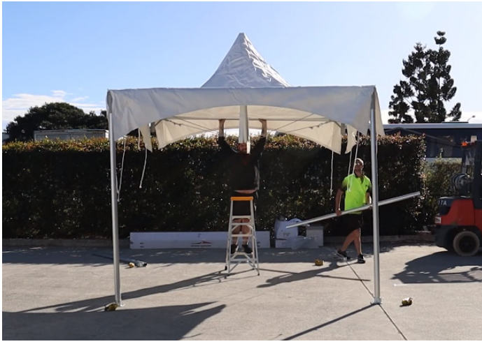
Insert the remaining legs into the corner connectors.