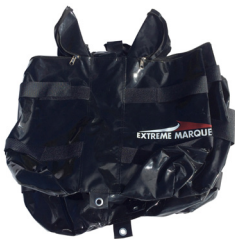
PVC Sandbags (x4) *