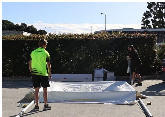
Layout the 4 aluminium legs.