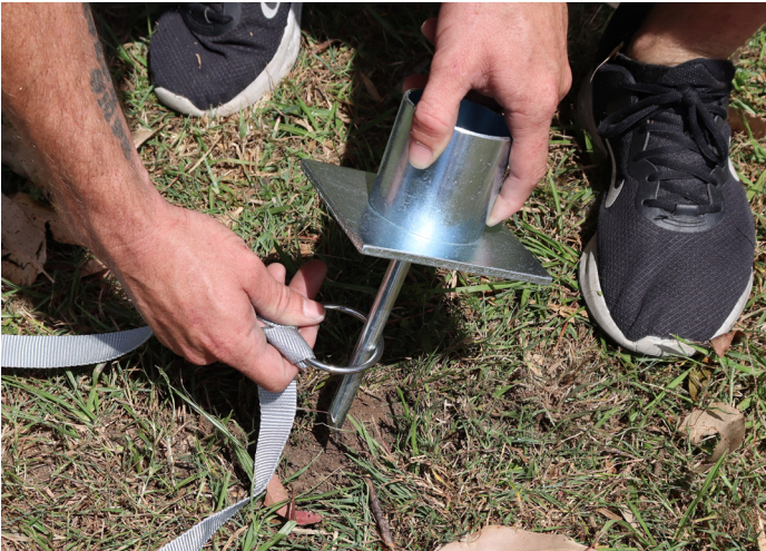
1. Loop one end loop of the stringline through the foot plate plate spike.

Please read instructions completely before setting up your Star Shade. Make sure you have all the components identified on the Parts List. Recommended procedure below. For safety reasons it is recommended that four people are requiard for set-up and pack down.