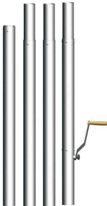
Aluminium Poles 5m pole x4 piece 6m pole x5 piece

Standard package items listed below. Please note accessories are not listed here.